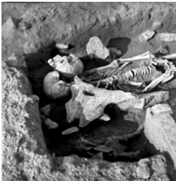
Fig. 2. An older man (Burial 7/I-a) with a disarticulated human skull (Burial 7/II-b) and an aurochs skull placed on his shoulders, and a red deer skull placed next to his body. The burial was cut through the floor of House 21, Lepenski Vir.

headed' hybrid; in addition, a red deer skull was placed next to the body of this 'composite' being (Fig. 2).