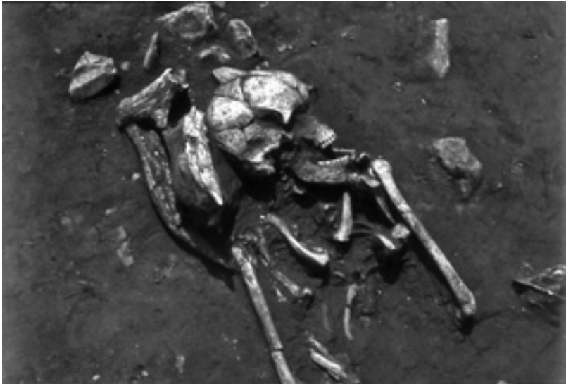
Fig. 4. A woman (Burial 93) with red deer antler, in the rear area of the Lepenski Vir settlement (photo from the archive of the Computer Documentation Centre, Faculty of Philosophy, Belgrade).

placed next to her skull (Fig. 4). Both burials were located in the rear area of the Lepenski Vir settlement (Fig. 1) (Radovanović 2000, 337). However, whereas both individuals 89a and 93 were transformed, it would seem they were transformed in different ways, and into different categories of being. While aurochs horns are permanent and can be removed from the animal only post-mortem, the woman was accompanied by shed antler, suggesting a more flexible relationship. Apart from its regenerative potential, which calls for a concept of ‘future’, shed antlers could perhaps enable the wearer to shift between identities and perspectives more freely.