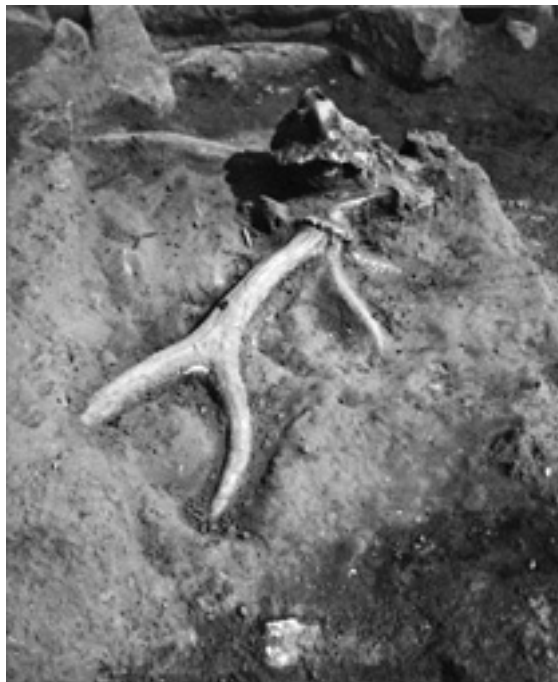
Fig. 3. Red deer skull placed upside down, House 22, Lepenski Vir (photo from the archive of the Computer Documentation Centre, Faculty of Philosophy, Belgrade).

Clutton-Brock (1999) notes that deer are highly territorial and drop their antlers in more or less the same place each year. Significant quantities of shed antler in all three sites could suggest that humans could have been aware of these places, perhaps following groups of stags and snatching antlers as soon as they fell ( cf. Clutton-Brock 1999, 13–14).